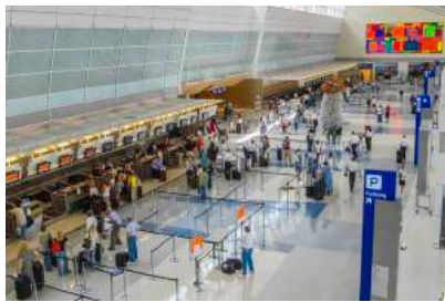
DFW DALLAS FORT WORTH INTERNATIONAL AIRPORT