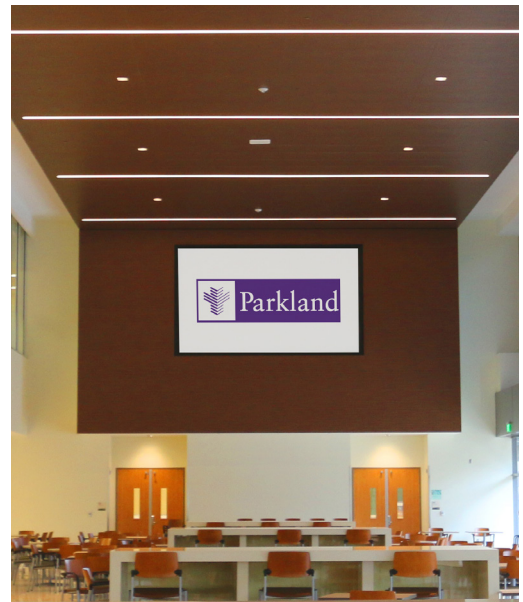
PARKLAND HOSPITAL | Dallas, TX

AV technology is essential in creating an environment that welcomes, informs and directs your guests and patients. Digital Signage provides wayfinding and custom message options. Displays can also integrate with a Life Safety System - directing visitors in an emergency.