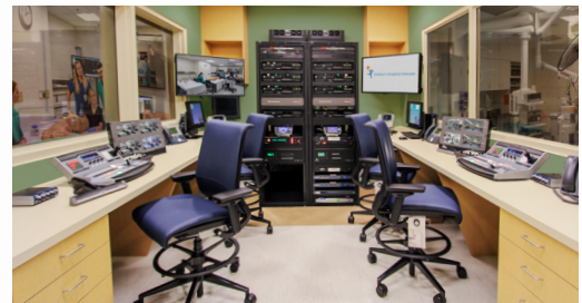
CHILDREN'S HOSPITAL COLORADO | Aurora, CO