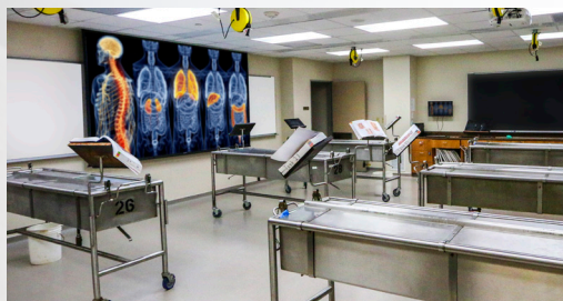
BAYLOR COLLEGE OF MEDICINE | Houston, TX