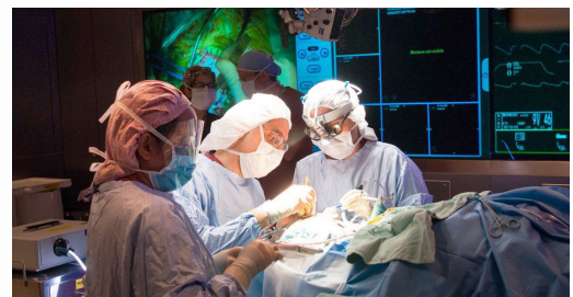
MD Anderson | Houston, TX