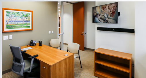
UT SOUTHWESTERN | Dallas, TX