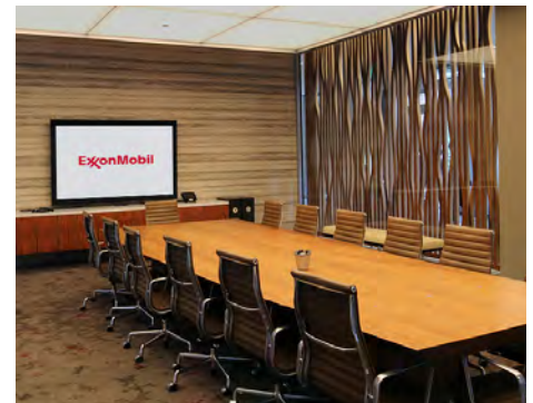
EXXONMOBIL Houston, TX

Energy companies use advanced AV systems with 3D visualization to find new sources of oil and gas. Videoconferencing systems improve communications resulting in better business decisions and the distribution of information and energy products. The use of AV technology can provide faster decisions with the ability to quickly and easily collaborate anywhere and anytime.