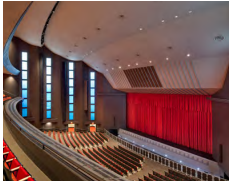
LILA COCKRELL THEATRE San Antonio, TX