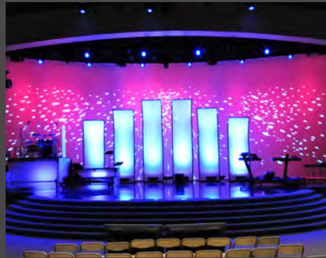
COTTONWOOD CHRISTIAN CENTER Los Alamitos, CA