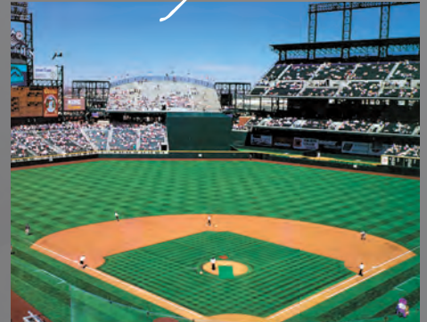
COORS FIELD Denver, CO

"Ford AV's commitment to getting the job done... was very impressive."