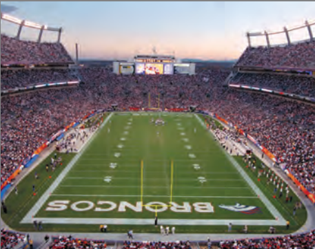
MILE HIGH STADIUM Denver, CO