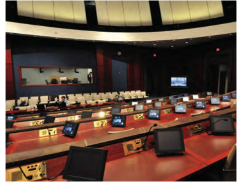
U.S. HOUSE OF REPRESENTATIVES Washington, D.C.

The U.S. House of Representatives engaged Ford to install new AV systems for multiple hearing rooms in 2002. Every year since, the U.S. House has awarded Ford additional projects and has come to depend upon precision installation that meets their demanding time schedules. Over four decades, Ford has provided installations for all levels and branches of governmental entities - Federal, state and local.