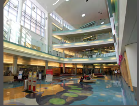
DENVER CHILDREN'S HOSPITAL Denver, CO

"The Ford AV team went out of their way to be flexible. Great work!"