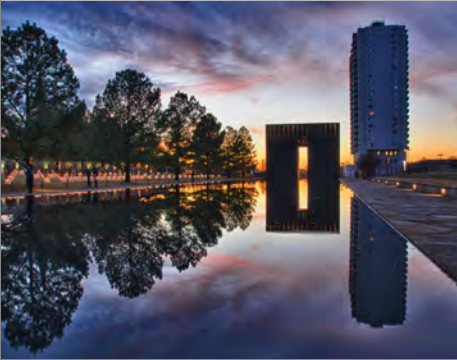
OKLAHOMA CITY NATIONAL MEMORIAL & MUSEUM Oklahoma City, OK