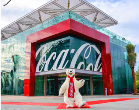
COCA-COLA DISNEY SPRINGS Orlando, FL