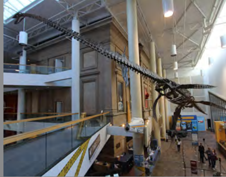
DENVER MUSEUM OF NATURE & SCIENCE Denver, CO