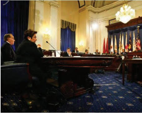
VETERANS AFFAIRS COMMITTEE BOARDROOM Washington, D.C.