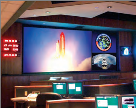
NORTHROP GRUMMAN Azusa, CA