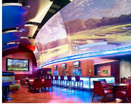
JW MARRIOTT HILL COUNTRY RESORT San Antonio, TX