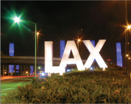
LOS ANGELES INTERNATIONAL AIRPORT Los Angeles, CA