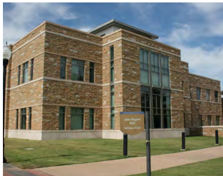
UNIVERSITY OF TULSA LAW SCHOOL Tulsa, OK