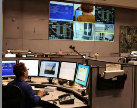
DALLAS/FORT WORTH INTERNATIONAL AIRPORT Dallas/Fort Worth, TX