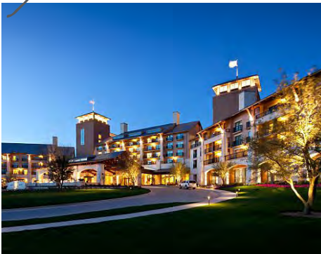
JW MARRIOTT HILL COUNTRY RESORT San Antonio, TX