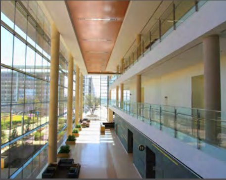
PARKLAND HOSPITAL Dallas, TX