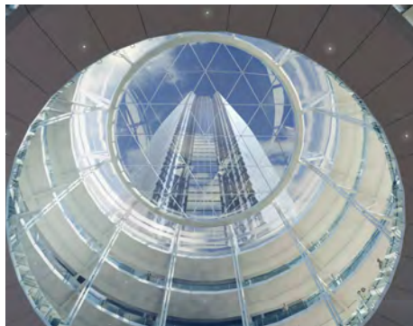
DEVON ENERGY Oklahoma City, OK