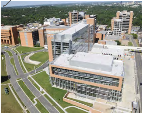
UNIVERSITY OF ARKANSAS FOR MEDICAL SCIENCES Little Rock, AR