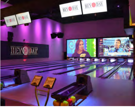
HEYDAY ENTERTAINMENT Moore, OK