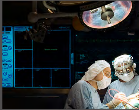
MD ANDERSON CANCER CENTER Houston, TX