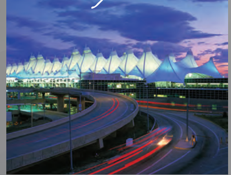
DENVER INTERNATIONAL AIRPORT Denver, CO

"Your team was excellent in every aspect of the project."