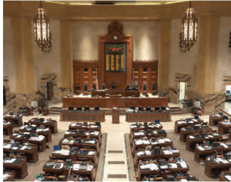
LOUISIANA STATE CAPITOL Baton Rouge, LA