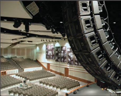
SOUTHEAST CHRISTIAN CHURCH Parker, CO