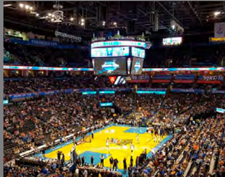
CHESAPEAKE ENERGY ARENA Oklahoma City, OK