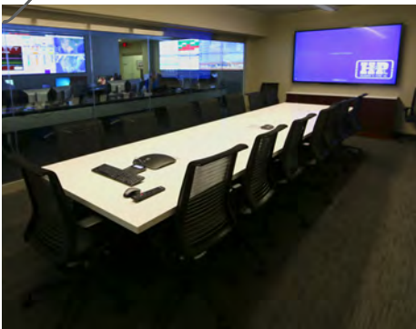
HELMERICH & PAYNE Tulsa, OK