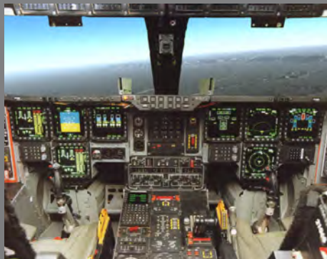
B-2 BOMBER SIMULATOR Tinker AFB, OK