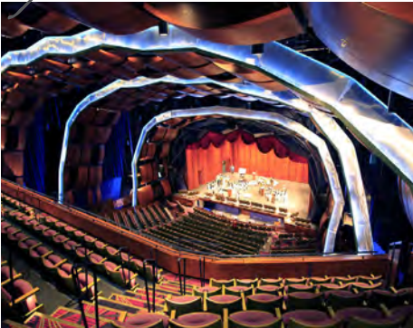
MCALLEN PERFORMING ARTS CENTER McAllen, TX