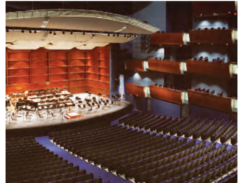
OKLAHOMA CITY CIVIC CENTER Oklahoma City, OK

The house lights dim, a hush settles over the crowd, the curtain opens. Lights! Sound! Action! The audience has come to be entertained and there is nothing like a live performance to provide that thrill, provided the acoustics, audio and lighting technology properly enhance the performers and scenery. To turn a good performance into a great performance, Ford provides exactly that balance.