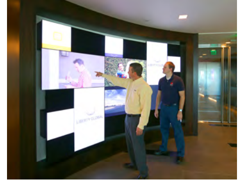
LIBERTY GLOBAL Denver, CO

Business is an exchange of ideas, thoughts, words, promises...In essence, communication is the key to every company's future. Once thought of as a luxury, AV technology has become a necessary means of communication. Whether it's a single boardroom or an entire corporate campus, Ford's experienced technical staff will design and install a system to help accomplish your goals.