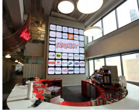
RETAILMENOT Austin, TX