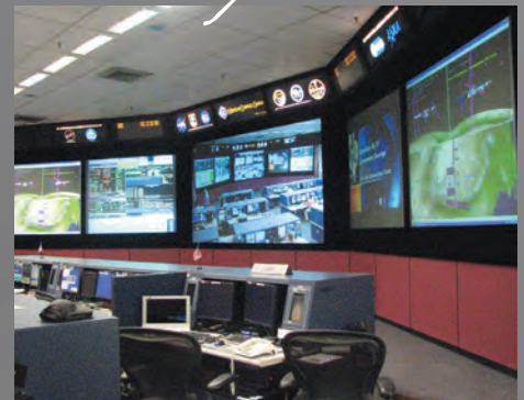
JOHNSON SPACE CENTER MISSION CONTROL Houston, TX

"I am very happy to recommend your company in pursuit of additional projects of a very complex nature.."