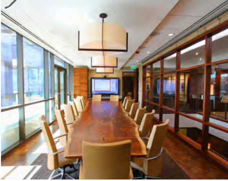
IMA Denver, CO