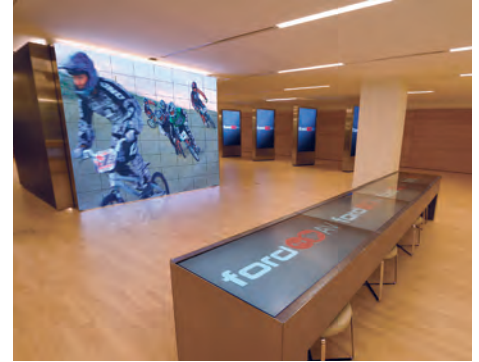
EXECUTIVE BRIEFING CENTER Dallas, TX

In today's market, digital signage is simply a smart business move. With this informational marketing resource, you can present your company's message instantaneously to customers worldwide from a desktop computer. Whether updating prices on a fast food menu or displaying the benefits of the latest hybrid car, let Ford provide the system while you decide how to creatively target your customers.