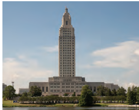
LOUISIANA STATE CAPITOL Baton Rouge, LA