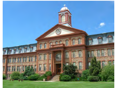
REGIS UNIVERSITY Denver, CO

The classroom is experiencing a global shift in providing curriculum to students through the use of computers, networks and AV display technology. wBlackboards are replaced with interactive whiteboards, TVs replaced with digital displays, and distance learning extends the reach of teachers to students all over the world. Educators use AV technology to help shape the minds of students who have grown up using computers and AV systems.