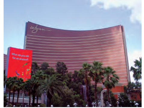
WYNN CASINO Las Vegas, NV

Conference centers and meeting facilities are expected to provide a unique setup for their customers' needs. This requires a flexible infrastructure system and an AV system that is equally flexible. Using wireless touchpanels, AV media, computer graphics, and data from any source can be routed to any combination of rooms in the facility. There are more ways than ever to enhance a visitor's experience.