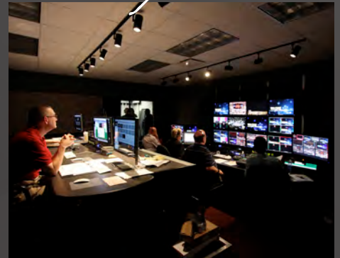
SAGEMONT BAPTIST CHURCH Houston, TX