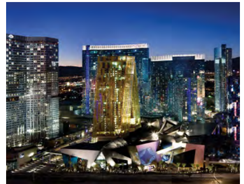
CITY CENTER Las Vegas, NV

On many projects, architects and AV consultants work with Ford to design high-quality systems installed to exacting specifications. Some of the consultants we have worked with include: Acentech, Acoustic Dimensions, ADG, Arup, BAi, Coffeen Fricke and Associates, DL Adams, Jaffe Holden, K2 Audio, Kirkegaard, McKay Conant Hoover, PMK, The Sextant Group, Shen Milsom & Wilke, Thorburn Associates, URS, Veneklasen, Akustiks, Cosentini, Datacom Design Group, Dickensheets, HFP, Ross & Baruzzini, TechKnowledge, Waveguide, and WJHW.