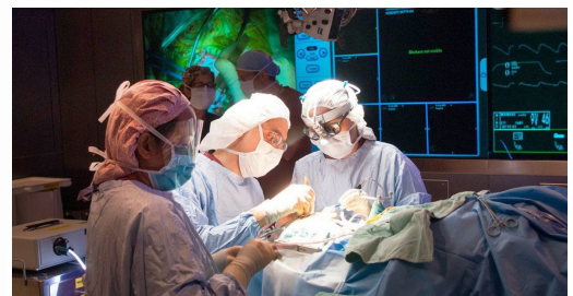
MD Anderson | Houston, TX