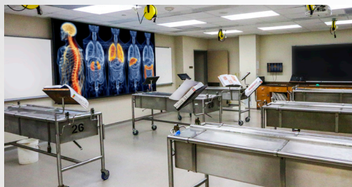
BAYLOR COLLEGE OF MEDICINE | Houston, TX